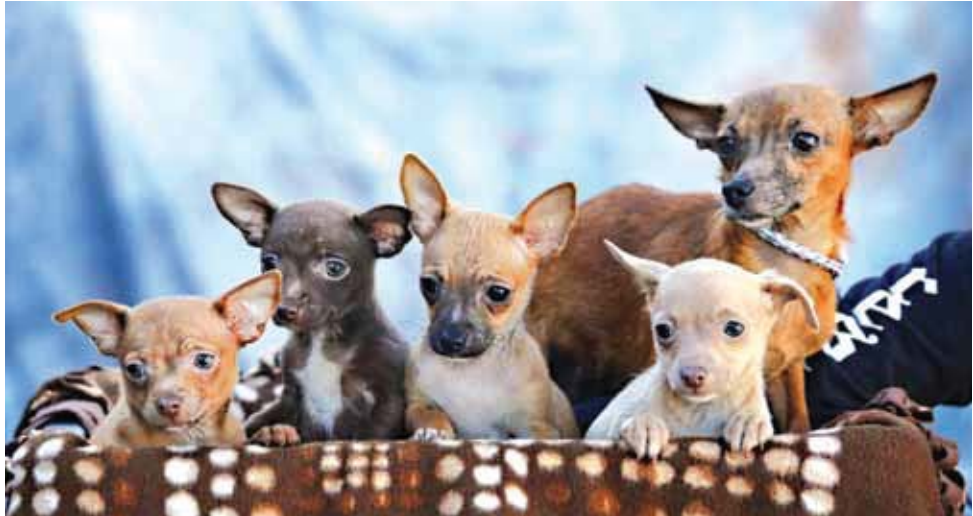
Racine and her 10 nweek old puppies.

them in his family. Gentle, loving, sweet, calm, mellow and easygoing, Connor is fabulous in every way. He was raised as an inside dog, is totally housebroken and has very good house manners. Connor walks superbly on leash and just loves to be with you wherever you are, no matter what you are doing. He would be best placed as an only dog or with another large female dog--he is not cat-safe. Remember that at 125 pounds, Connor can eat fair amount of dog food, so keep this in mind when budgeting for a new family member. Connor is neutered, current on vaccinations, has had a dental, is de-wormed, microchipped