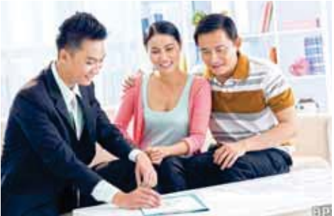
Turn your tax refund into savings.

TreasuryDirect is a registered mark of the U.S. Department of the Treasury. Ready.Save.Grow. is a service mark of the U.S. Department of the Treasury. •